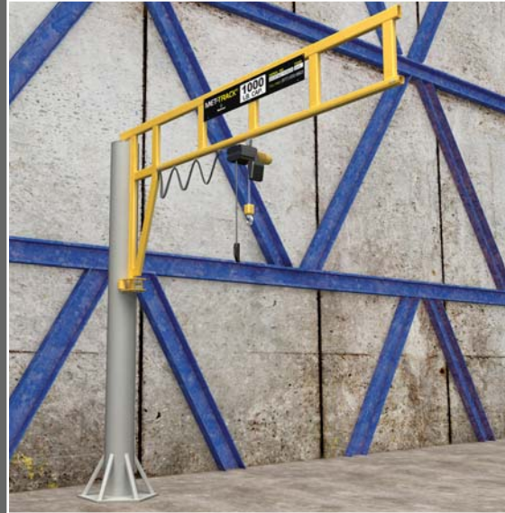
WORKSTATION JIB CRANES