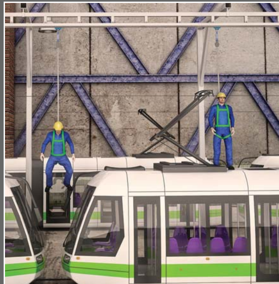
FALL ARREST & RESTRAINT

ENCLOSED TRACK MECHANICAL HANDLING & SAFETY SOLUTIONS